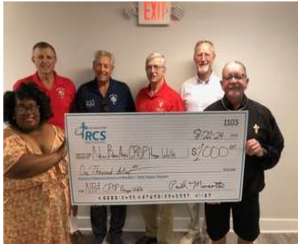
RCS CONTRIBUTION OF $1,000.00