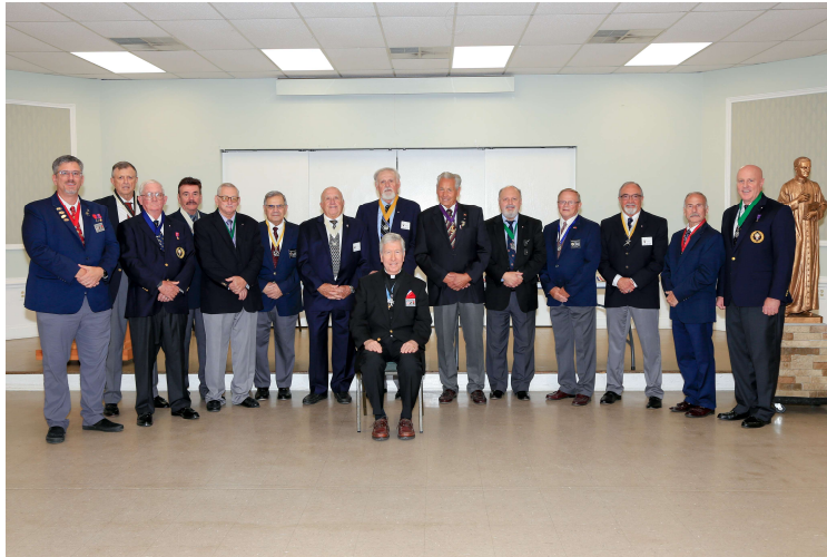
COUNCIL 3303 & ASSEMBLY 1820 NEWLY INSTALLED OFFICERS