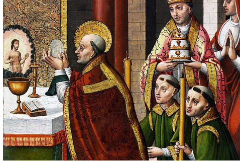
FIGURE 1: MASTER OF PORTILLO, "THE MASS OF ST. GREGORY THE GREAT"

There is a Eucharistic chapel at St. Francis Church in Raleigh. That's where I go on my free days to spend an hour with the Lord. During that hour I hardly speak a word. It used to be that I probably spoke far too many words while in prayer. Sometimes a flash of piercing insight will dawn on me during that hour. Days such as that are the exception. The reason that I go there is to spend time with the One who calls us friends. Sometimes I even wonder whether he gets lonely when that room is empty.