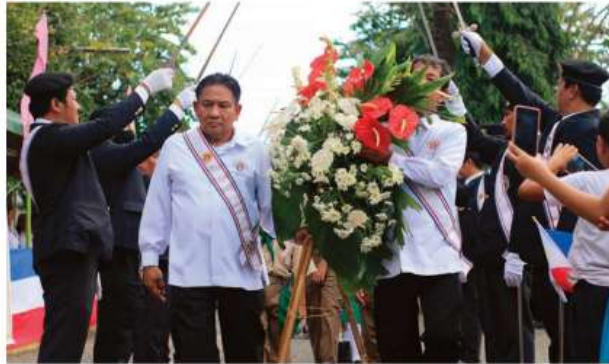
Members of St. Francis of Assisi Assembly 3602 in Dasmariñas City, Luzon South, provide an honor guard as Knights carry memorial wreaths during a ceremony honoring the 127th anniversary of the death of Jose Rizal, a hero of the fight for Philippine independence in the late 19th century. Columbian Squires were also involved in the ceremony at Dr. Jose P. Rizal Elementary School.