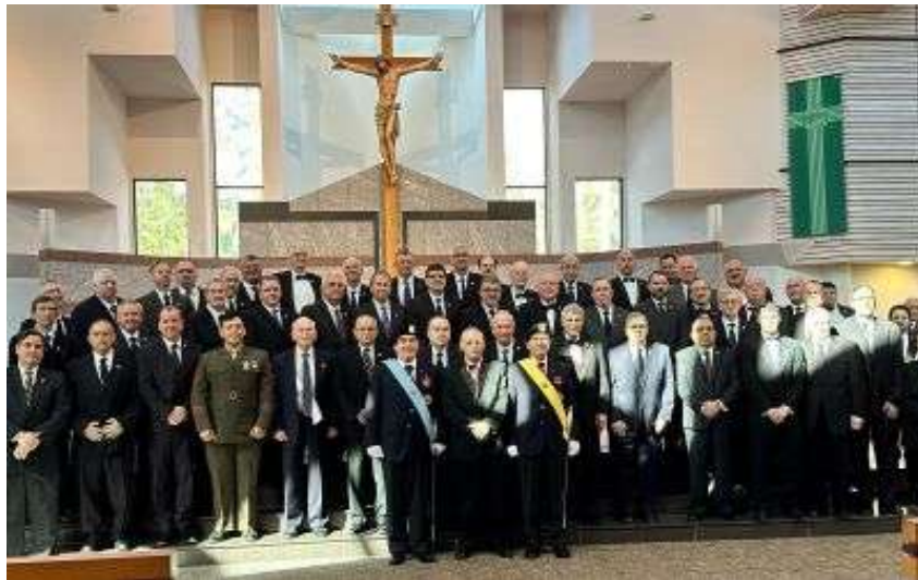
Candidates, Observers, and State Officers