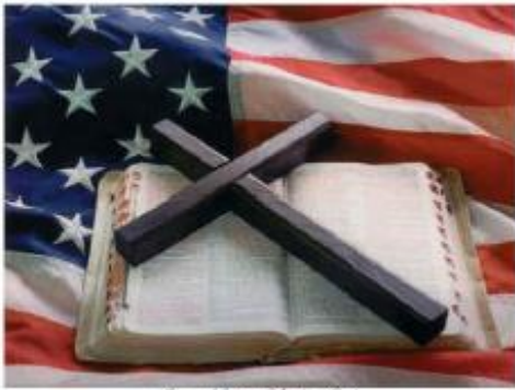
...One Nation Under God...