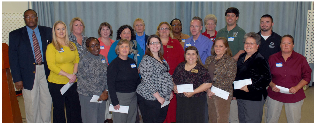
Pictured above are the 2010 LAMB Fund Recipients.

Even though we faced an economic challenge during the LAMB 2010 operations, over 130 Knights and their wives and friends stood up to the challenge.